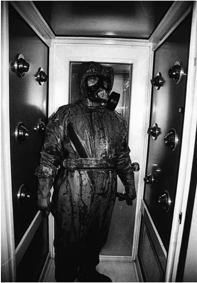
Figure 3. Investigator wearing full personal protective equipment in the air-decontamination unit.

during autopsy was inevitable, we decontaminated the area after each autopsy. The air was sterilized with UV light for 1 h, surfaces and the floor were decontaminated with 0.5% peracetic acid containing chlorine, 3000 mg/L, and the same disinfectant was distributed by aerosols at a concentration of 20 mL/m 3 . Two additional lower-power fans in the ventilation system maintained a persistent, mild negative pressure gradient in our laboratory during working breaks.