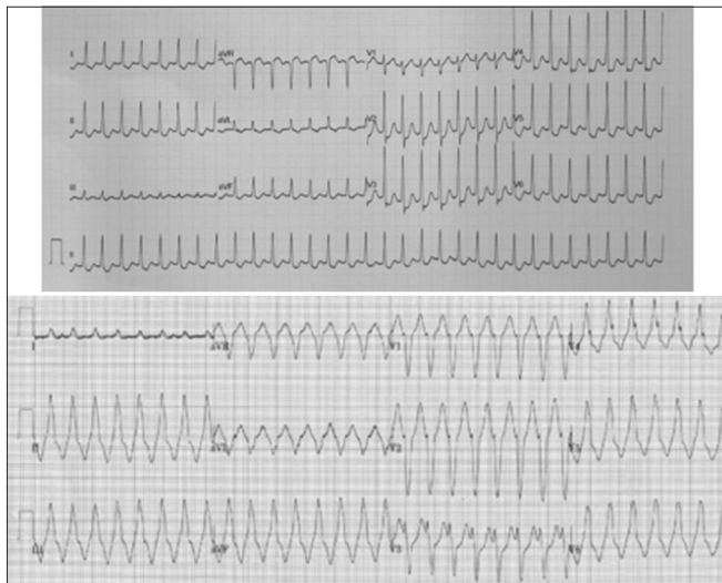
Figure 1: Upper panel shows supraventricular tachycardia; lower panel shows ventricular tachycardia in another patient

(2 acute VT, 1 sub-acute VT, 1 acute + sub-acute VT). ECG: Electrocardiogram, APCs: Atrial premature complexes, VPCs: Ventricular premature complexes, SVT: Supraventricular tachycardia, PJRT: Permanent junctional reciprocating tachycardia, VT: Ventricular tachycardia, AV: Atrioventricular, DC: Direct current, SD: Standard deviation, LVEF: Left ventricle ejection fraction