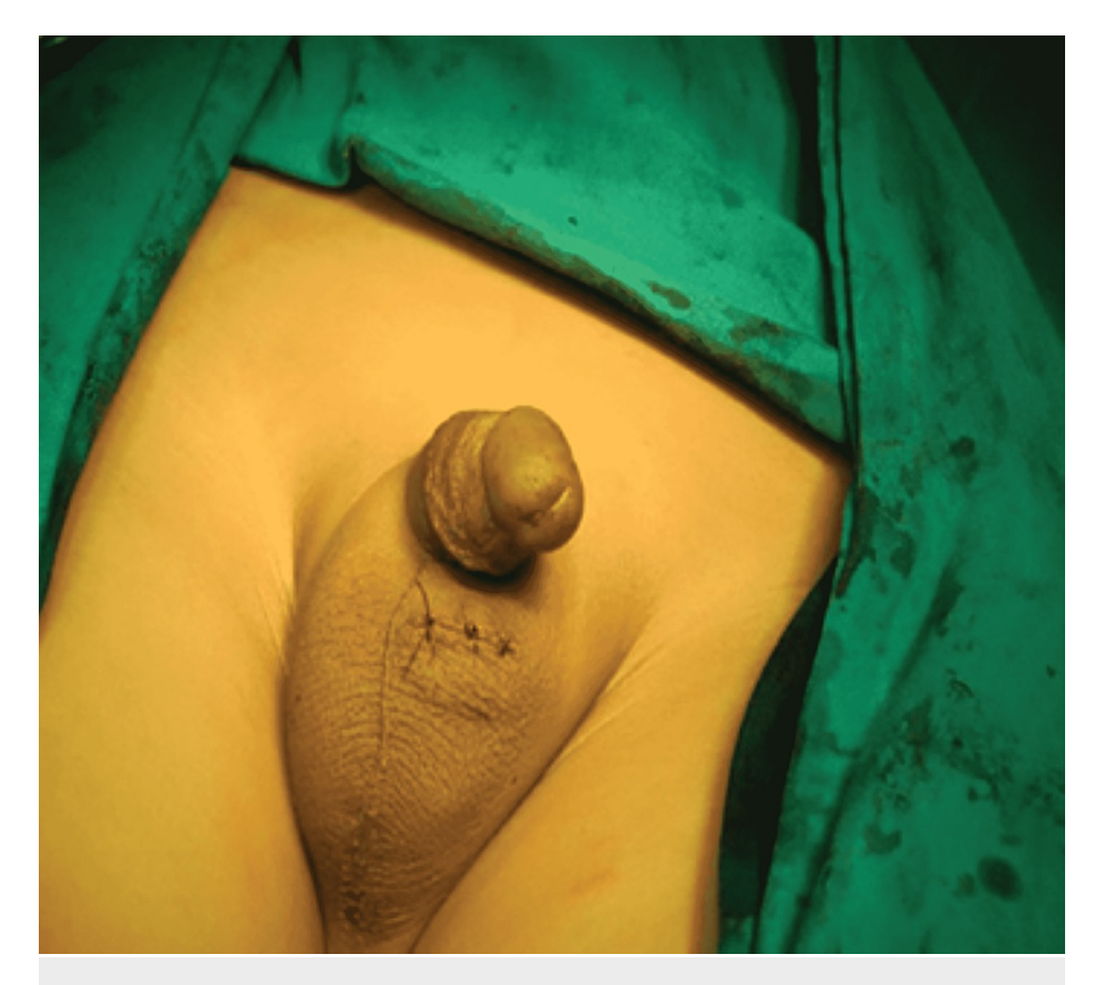
FIGURE 2: Final appearance after closure of scrotal skin incision

inguinal canal and brought down into the scrotum after doing a herniotomy. The sub-dartos pouch was created through a scrotal incision and the testis was fixed there. In patients with bilateral palpable undescended testes, only one side was operated and the right side was operated priorly. Operative time of the procedure was recorded. Scrotal hematoma formation was noted one day after surgery and secondary ascent was noted one week after the procedure. All the gathered information was noted on a predesigned performa.