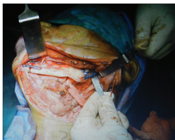
Figure 2: Per-operative view of fixation of mandibular segment with titanium plates and screw