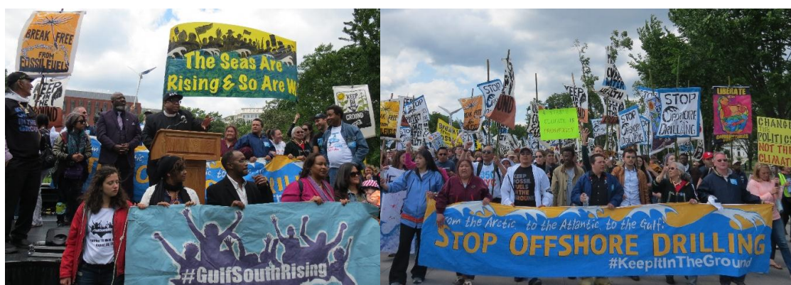
Figure 2. “Break Free” Protests in Washington, DC (Photo credits: Mary Finley-Brook).

Anti-fossil fuel protests are occurring throughout the world with increasing frequency. National and international networks organizing and participating in these rallies generally include a relatively limited number of EJ and CJ groups amidst many non-governmental organizations (NGOs), faith-based groups, and concerned citizens motivated to take a proactive role in determining the speed and direction of energy transitions. “Break Free” actions in May of 2016 involved protests on six continents, including blockades at several coal and gas sites leading to arrests. In Washington, DC, frontline communities from the Arctic, Atlantic, and Gulf (Figure 2) led a rally and protest march to denounce offshore oil drilling and sea-level rise, stating “the seas are rising and so are we”. This phrase expresses momentum toward and desire for procedural justice.