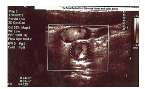
FIGURE 2: Carotid doppler ultrasonography shows left carotid artery with thrombus formation.

Her other laboratory parameters, including white blood count, chemistry panel, urea, and creatine, were also within normal limits, and her electrocardiogram and chest X-ray were normal. Thrombophilia studies were negative following tests for antiphospholipid antibodies (anticardiolipin, IgG, and IgM antibodies), and no evidence of lupus anticoagulant was detected. Protein C, protein S, antithrombin III, fibrinogen, vitamin B12, folate, homocysteine levels, prothrombin, and partial prothrombin levels were within normal ranges, and the prothrombin gene variant G20210 and Factor V Leiden mutations were not detected. Antinuclear antibody, anti-DNA antibody, and antineutrophil cytoplasmic antibody tests were also negative. A transthoracic echocardiogram showed no evidence of septal defects or a cardiac source of emboli. The patient could not tolerate transesophageal echocardiography, so it was not performed. Brain magnetic resonance imaging (MRI) revealed a subacute left parietooccipital, right frontal, and bilateral infarction (Figure 1).