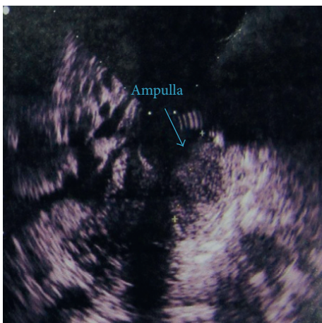
FIGURE 2: Endosonographic imaging exhibited a hypoechoic lesion at the ampulla.

dilated in the body of the pancreas. Moreover, the common bile duct (CBD) was distally thickened and contained sludge. Subsequently, diagnostic biopsy for pathological assessment was done. The biopsy revealed an irregular gray-creamy soft tissue which had undifferentiated malignant tumor features at microscopic evaluations. During the Whipple procedure, after cutting the neck of the pancreas in the left side of the portal vein, the frozen section revealed more involvement of pancreatic tissue. Although additional 2 cm was resected, the pancreas residue still had tumor involvement, macroscopically. Therefore, the patient was undergone total pancreatectomy.