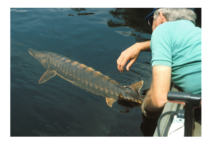
Figure 1. Gulf Sturgeon ( Acipenser oxyrinchus desotoi ). Photo: Joe Hightower. doi:10.1371/journal.pone.0071552.g001

Sturgeons may move from one location or habitat type to another to feed, reproduce, or overwinter. River movement can be complex and include multi-step migrations [10] and include movement between and among rivers suggesting a meta-population structure [11]. Within a species, populations can differ on the timing of migrations into river systems, time spent within the river (holding), and the distance (upstream) from the marine environment where spawning occurs. Directed migrations from overwintering locations to feeding habitats, in some cases timed to intercept specific, localized prey species, may be a populationbased behaviour; other populations of the same species may