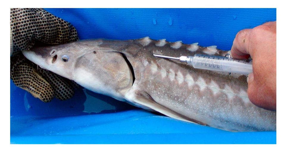
Figure 4. Illustration of the preferred location of PIT tag application on a juvenile White Sturgeon. The PIT tag is injected just beneath the skin, about 1 cm behind the head plate, on the left side of the dorsal scute line. doi:10.1371/journal.pone.0071552.g004

identified the timing and location of spawning, a topic of obvious interest to those working on conservation of sturgeon. These studies have relied on both acoustic and radio tracking, often in combination, and typically have made use of mobile tracking to detect tagged sturgeon. A related type of study examines the movement and habitat use of cultured sturgeon after release.