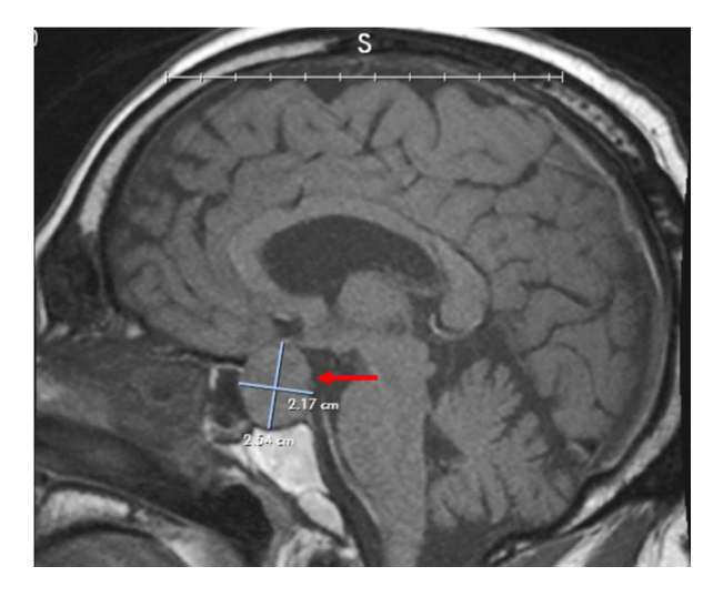
Fig. 1. Magnetic resonance imaging showing a pituitary macroadenoma (2.17 \times 2.54 cm) minimally elevating the optic chiasm and bulging into the right cavernous sinus (arrow).

could not be fully assessed due to the patient's decreased level of consciousness.