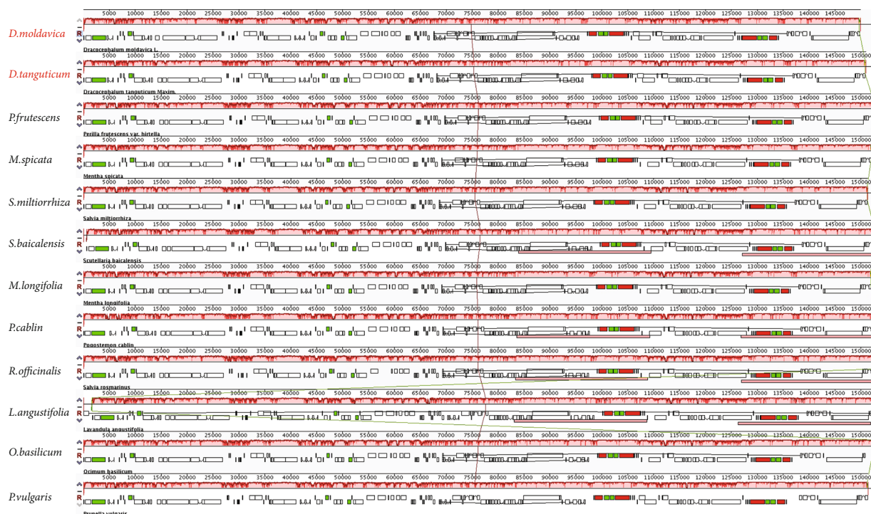
FIGURE 3: Chloroplast gene sequence alignment of 12 species of Lamiaceae . The rectangles represent the locations of genes in each genome. White represents CDs, green represents tRNA, and red represents rRNA.