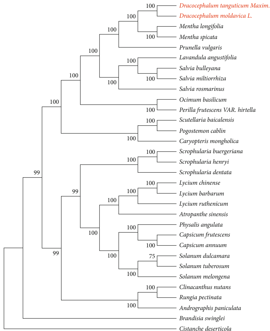
FIGURE 4: Phylogenetic tree constructed from the complete chloroplast genome.

genomes with SPAdes v3.10.1 ( http://cab.spbu.ru/software/spades/ ) software.