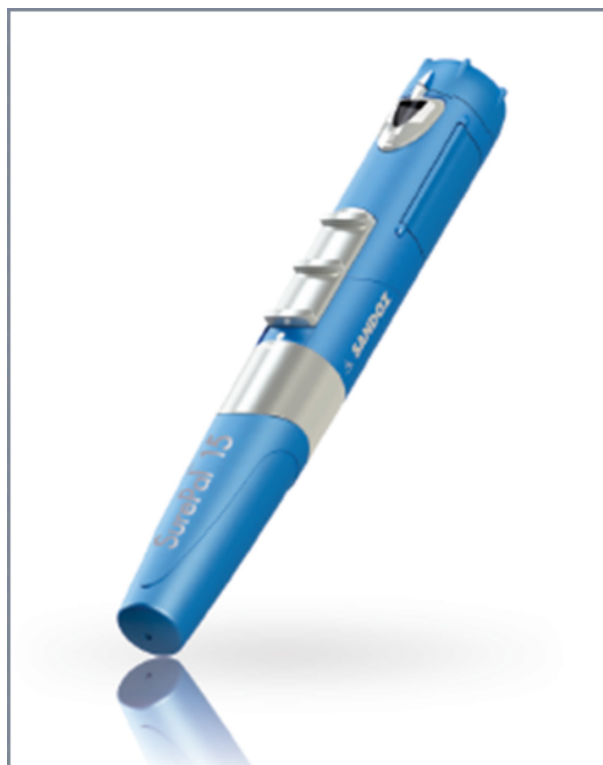
Figure 1 The pen device.

The pen evaluated in the study was a multidose, semi-reusable needle-based injection system (Figure 1). This new