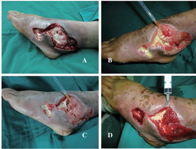
Figure 1. Observation of the diabetic foot of a patient in the insulin treatment group. The patient was male, aged 65 years and had a 28-year history of diabetes. The wound in his left foot did not heal for 3 weeks. (A) The wound, which was level with the 4th and 5th toes of the left foot, following the debridement of necrotic tissue. (B) After 5 days of local insulin injection, the necrotic tissue became partially desquamated and granulation tissue began to grow. (C) After 7 days of local insulin injection, the necrotic tissue became mostly desquamated and the granulation tissue grew well. (D) After 12 days of local insulin injection, the joint cavity closed completely. The granulation tissue grew well and the wound bed was perfectly suited for surgery.