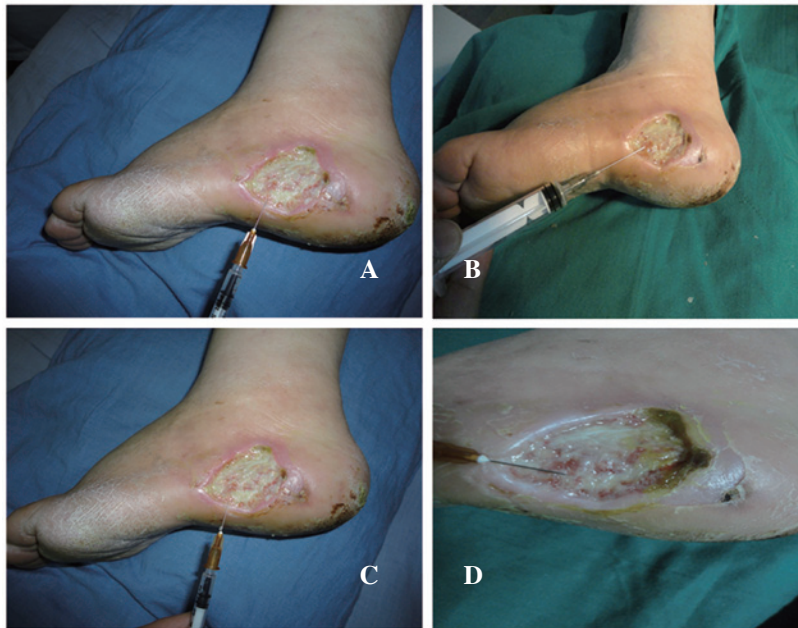
Figure 2. Observation of the diabetic foot of a patient in the control group. This patient was male, aged 68 years and had a 30-year history of diabetes. The wound in his left foot did not heal for 3 weeks. (A) The wound in the left heel following the debridement of the necrotic tissue. (B-D) Appearance of the wound after (B) 5 days, (C) 7 days and (D) 12 days of local injection of normal saline.

that the local injection of insulin in diabetic foot ulcers could promote the growth of granulation tissue.