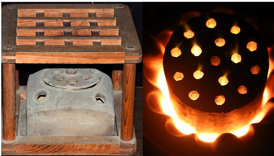
Figure 2 Kotatsu with briquettes (left) and briquette braziers (right). The kotatsu is a Japanese traditional heating table covered with a blanket. The kotatsu dates to the Japanese era over 500 years ago. Charcoal or briquettes were used as a heat source before electricity was introduced.