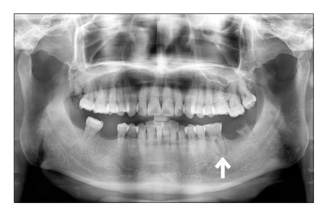
Fig. 3. Panoramic view. Radiolucent lesion of the periapical area of a mandibular molar (white arrow).

ture, remaining tooth (root rest), and periodontal infection<sup>3</sup>. The majority of odontogenic sinus fistulas have an intraoral opening<sup>4</sup>, but in cases of chronic dental infection, the local inflammatory destructive process progresses slowly as an alveolar bone abscess. Once the inflammation passes through cortical bone and periosteum, it may spread into the surrounding soft tissue, limited by muscle attachments and facial regions (Fig. 4)<sup>3</sup>.