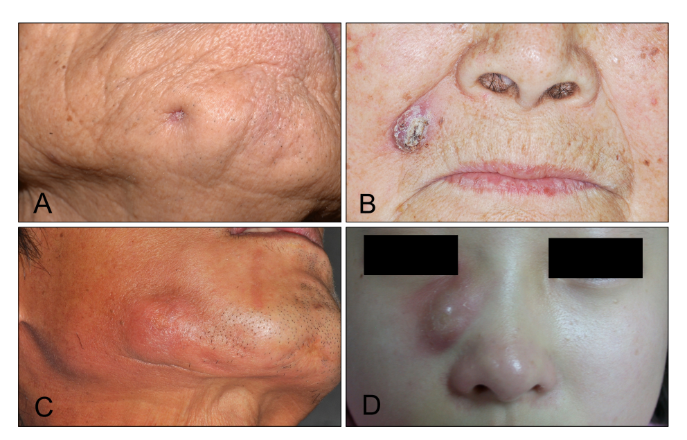
Fig. 1. Clinical photos showing the various morphologies of odontogenic cutaneous fistulas. (A) Dimpling, (B) nodule, (C) abscess, (D) cyst.