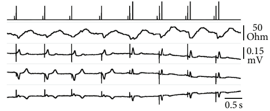
FIGURE 3: Real-time telemetry of event markers (1st tracing) and transvalvular impedance (2nd tracing) with simultaneous surface ECG recording (I, II, and aVR from the 3rd to bottom tracings, all with the same voltage scale) during ventricular threshold analysis in VDD. On the markers tracing, short bars represent atrial sensing, intermediate bars ventricular pacing, and the longest bars ventricular sensing in the pacemaker refractory period. From the 5th pulse onward the stimulation was below threshold and a narrow QRS replaced the pacing-evoked wide complex. Nevertheless, a properly timed TVI fluctuation was present, confirming the ejection occurrence, and the energy scan continued down to the minimum pulse amplitude available.

3.3. Prevalence of Capture Failure Alarms. The prevalence of false alarms of capture loss during daily life activity did not exceed 0.25% of paced ventricular beats in 47% of the patients. The frequency distribution of the individual