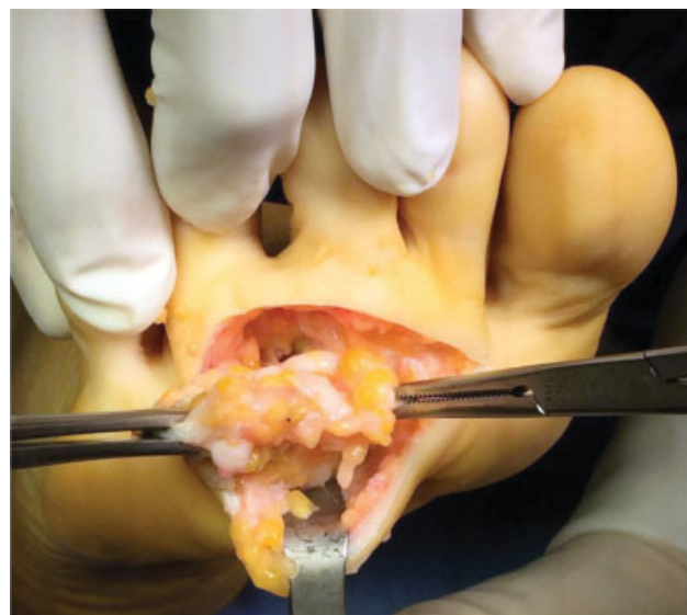
Fig. 1 Dissection of the lesion through a plantar transverse approach.

The lesion was excised trying to follow the common digital nerve proximally and to isolate the two digital nerves