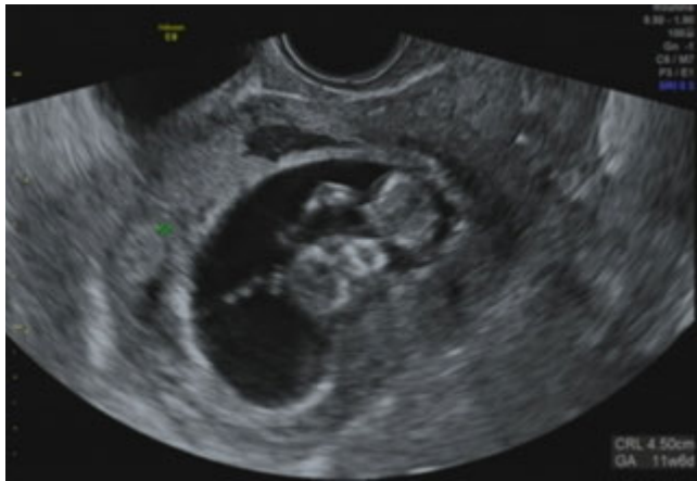
Figure 2. Exact location of the gestational sac with the fetus.