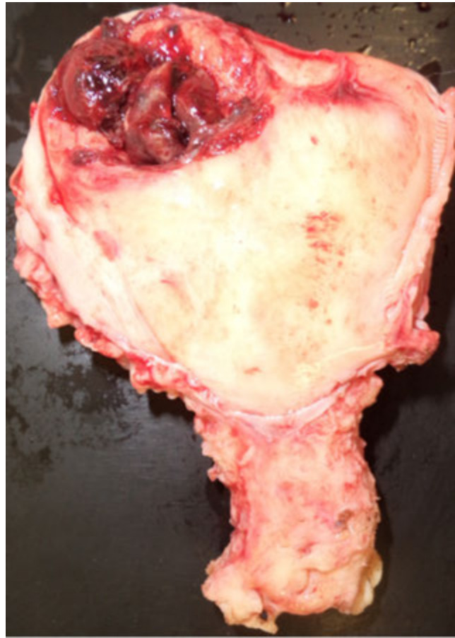
Figure 3. Uterine rupture at the previous Cesarean scar.

for stratifying patients at risk of uterine rupture. Most Cesarean sections were carried out using a transverse lower segment incision. As the non-sonographic symptoms of transverse fundal incision are unclear, this case of CSP went undetected initially. The diagnosis of suspected CSP has been reported between 5 and 8 weeks of gestation. Most cases of CSP have been diagnosed in the first trimester by transvaginal ultrasound. 9-11 In this patient, uterine rupture at 11 weeks of gestation is a rare event.