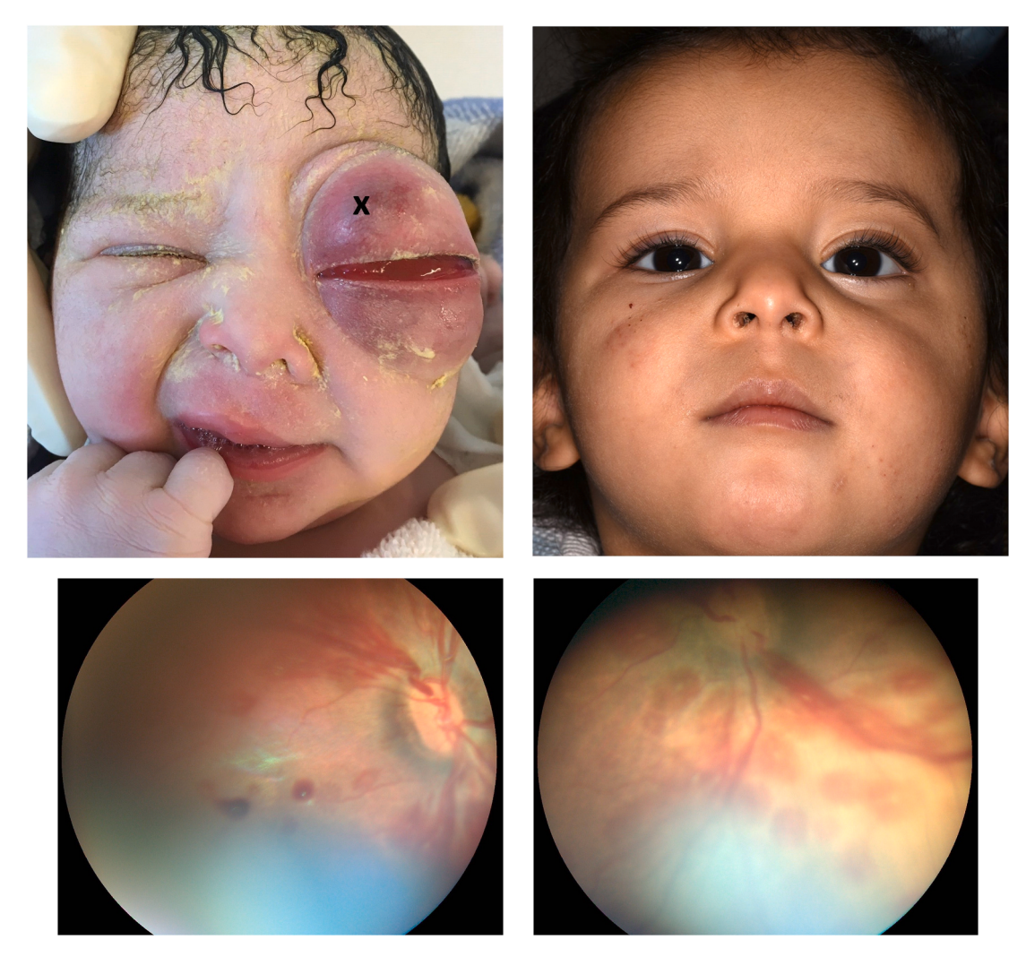
Fig. 1. A At birth the eye globe (x) is luxated cranially and medially out of the Orbit.B After surgery the eye globe returned into correct vertical position.C Fundus picture on 2nd day of life with bleeding, right eye.D Fundus picture on 2nd day of life with bleeding, left eye.

Three months postoperatively, a control MRI showed a fully normal brain parenchyma with age-appropriate myelination; there was no evidence of residual tumor or local relapse. The retinal hemorrhage was completely resorbed. Six months postoperatively, a slight regression of the left abductor nerve palsy was observed. There was residual