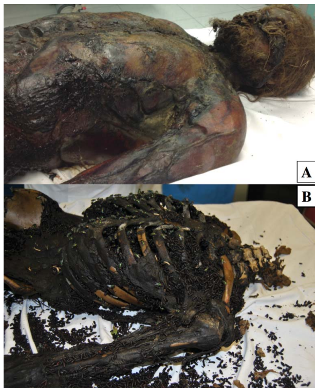
Figure 2. The decomposition pattern of the two hanging bodies: the mummified soft tissues of the upper part in case 1 (A), pre-skeletonization of the thorax and the neck in case 2 (B).

Insect activity was visible only on the face where few Diptera larvae (1.5–1.8 mm in length) were recovered. A large amount of adults and active larvae of Coleoptera were also detected from the scalp. Beetles adults and larvae represented the predominant part of the insect community. Just few Diptera pupae and puparia were recovered in the drip zone below. The insect community recovered on the body and at the drip zone was identified according to species-specific morphological identification keys as summarized in Table 1. The