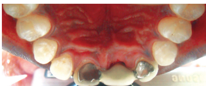
Fig. 6: Postoperative picture of the patient after cementation of the Maryland Bridge (palatal view)

times over the course of a young patient's life with the additional loss of tooth structure. 7