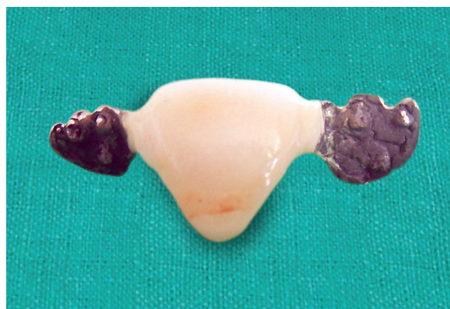
Fig. 4: Preparation of webbings on the incisal edge of the metal wings

The next option that can be explored is a fixed partial denture which requires significant tooth reduction. The enlarged pulp chamber in an adolescent may prompt the clinician to make an underprepared tooth with a resulting oversized finished crown. Increased pulpal response during tooth preparation and later the possible exposure of the crown margins as natural apical migration of the epithelial attachment proceeds with age, may also act as deterrents. 6 Further, the longevity of the fixed partial denture is reported to be 8.3 to 10.3 years, requiring replacement three or four