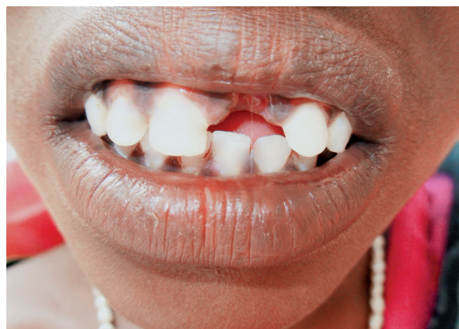
Fig. 1: Patient reports with fractured maxillary left central incisor

A female patient, aged 13 years, presented with a fractured maxillary left central incisor and desired a stable esthetic solution (Fig. 1). Three years ago, patient had fractured the tooth due to a fall. Patient did not give any clear history about the dental treatment she received after the fracture. On examination, it was revealed that no crown structure was visible clinically and only a root stump remained in relation to the aforementioned tooth. Apart from that the