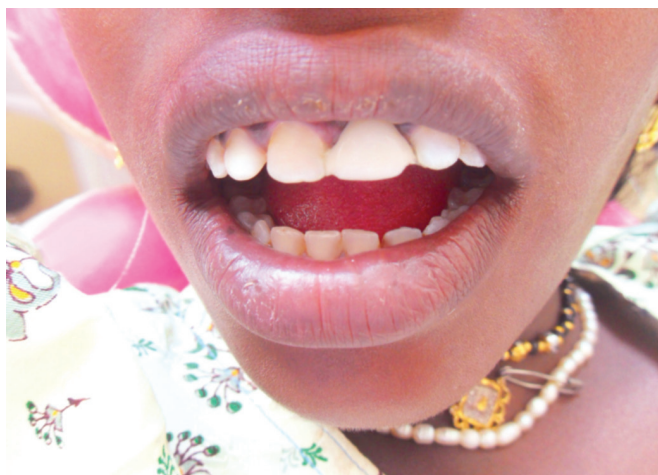
Fig. 5: Postoperative picture of the patient after cementation of the Maryland Bridge (labial view)