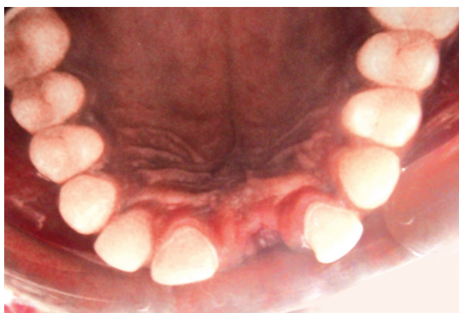
Fig. 3: The tooth preparation of maxillary right central incisor and left lateral incisor on the palatal aspect

After completing oral prophylaxis, extraction of the root stump was done. Tooth preparation for both 11 and 22 was done following the standard technique. 2 Lingual preparation ended 2 mm from the incisal edge and a light chamfer finish line was prepared 1 mm supragingivally (Fig. 3). An impression was made in polyether impression material and sent to the laboratory. After the metal try-in was successful, shade selection was done using a shade guide. The trial fitting of the prosthesis was done and then esthetics, mastication and speech were evaluated. In this case, the esthetics had to be compromised slightly as the edentulous space was wider than the mesiodistal width of the original tooth, leading to an oversized pontic. It was therefore elected to cover the metal retainers with porcelain.