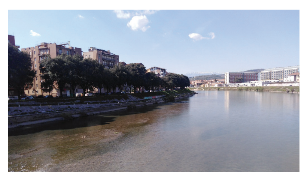
Figure 3. Type locality of Synorthocladius federicoi sp. nov., Adige River, Verona (northern Italy).

Chironomid species encountered with S. federicoi sp. nov. include: Conchapelopia pallidula (Meigen, 1818), C. melanops (Meigen, 1818), Paramerina cingulata (Walker,