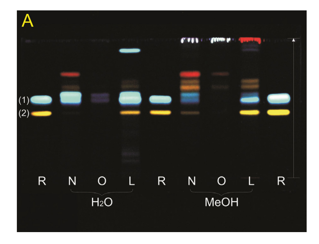
Figure 1. TLC profiles of the extracts. Extracts: (N) sterile shoots, (O) older stems, (L) leaves; References R: (1) chlorogenic acid R_f = 0.55 , (2) rutin R_f = 0.46 , (3) ursolic acid R_f = 0.50 ; Mobile phase and detection: (A) ethyl acetate:formic acid:acetic acid:water 100:11:11:27, natural products reagent and PEG, 366 nm; (B) toluene:diethyl ether 1:1 (saturated with 10% acetic acid), anisaldehyde reagent, 366 nm.

TLC profiles were made of all extracts. The extracts were investigated with different TLC systems to separate the compounds and to investigate constituents with suitable pure reference substances. Many substances were tested as references, only four showed similar migration distances as compounds in the extract. For the polar extracts emphasis was set on flavonoids which presented with an orange fluorescence in the TLC after derivatization with natural products reagent and PEG. The flavonol glycosides quercetin-3-O-rutinoside (rutin), quercetin-3-O-galactoside (hyperoside) and quercetin-3-O-glucoside (isoquercetin) had similar R_{f} -values when compared to the R_{f} -values of compounds native to the aqueous and methanolic extracts. Rutin seemed to be present especially in the leaves and to a lesser extent in the sterile shoots. It was not visible in the extracts of the old stems. Chlorogenic acid was present mostly in the polar extracts of the leaves and young sterile shoots (Figure 1A). In all extracts except the aqueous extracts, the characteristic fluorescence of ursolic acid when sprayed with anisaldehyde reagent (red-brown with lime-green border) was discovered (Figure 1B).