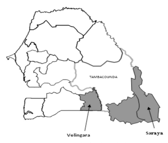
FIGURE 1. Map of Senegal showing the study sites. Saraya and Velingara are districts were seasonal malaria chemoprevention (SMC) has been implemented since 2007, whereas in Tambacounda, SMC has not been implemented and thus, function as a control district.

(Whatman 3M; Maidston, Life Sciences United Kingdom), and stored with silica gel at 4°C until the serological analyses. Thick and thin blood films were also done for microscopic identification of Plasmodium species.