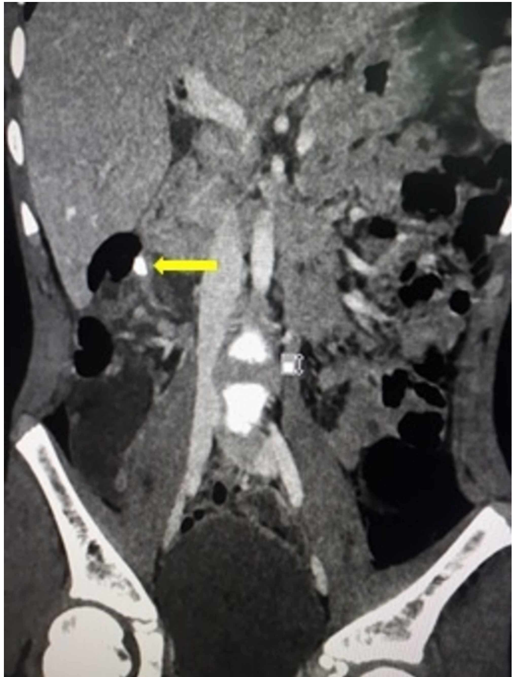
FIGURE 2: Coronoal CT scan of the abdomen depicting a subhepatic appendicolith (yellow arrow).

A diagnosis of an abnormally located perforated appendix with localized collection was made, and the patient was subjected to laparotomy. During exploration, an abnormally high lying cecum was observed in the right hypochondrium; the ascending colon was absent and a redundant dilated transverse colon was seen. An early inflammatory mass involving the cecum, transverse colon, omentum and the duodenum was detected. Upon manipulation, a pocket of pus was detected and drained (approximately 20 ml). The cecum was mobilized by incising the lateral peritoneal reflection. The appendix was located immediately medial to the ileocecal junction craniocaudally with the tip trailing superiorly in Morison's pouch. The appendix was