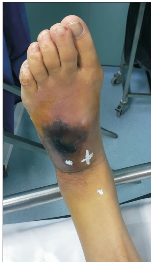
Fig. 1. Preoperative clinical evaluation revealed a giant mass on the dorsum with skin necrosis.

Open surgical repair was selected as the most appropriate approach due to the skin necrosis. Under local anesthesia, a longitudinal incision was made over the proximal DPA. After proximal control, the aneurysm was exposed and the clots were removed. An anterior wall defect of the DPA was confirmed as the cause of the pseudoaneurysm. Because the back-bleeding from the distal DPA was active, ligation of the proximal and distal DPA was performed safely, followed by debridement of the necrotic foot dorsum (Fig. 3). A second operation was performed a few days later by plastic surgeons to cover the skin defect with a cutaneous flap. The postoperative course was uneventful, and no complications such as flap inflammation or toe gangrene were noted. After the 6-month follow-up, she recovered well with no signs of forefoot ischemia. Informed consent was obtained from the patient for publication of this case