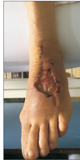
Fig. 3. Postoperative image shows the skin deficit after ligation of the dorsalis pedis artery and debridement of the dorsum.