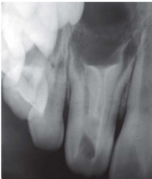
Fig. 2: IOPA showing Dens invaginatus i.r.t. upper right lateral incisor