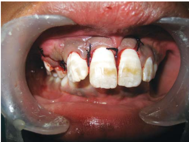
Fig. 5: Postoperative suturing