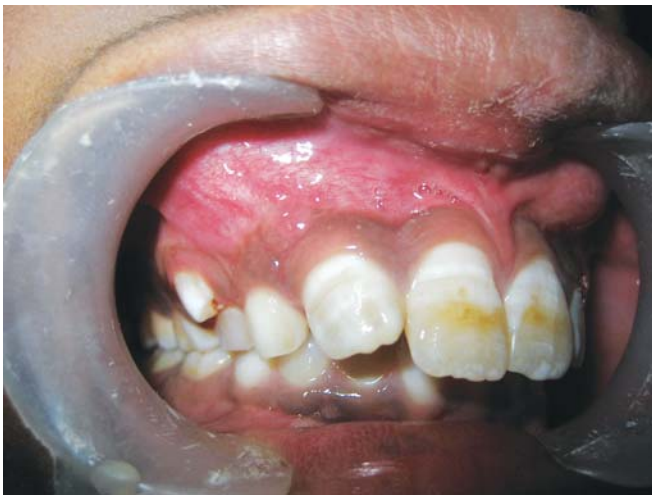
Fig. 1: Clinical presentation