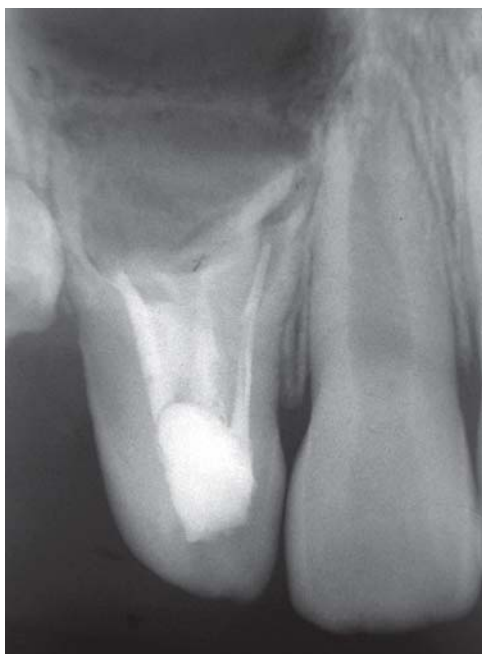
Fig. 8: Follow-up radiograph after 1 year

prophylactically with resin. 12 In cases in which the bacterial invasion has reached the pulp and necrosis is established, nonsurgical root canal treatment remains the treatment of choice. Depending on the type of malformation and the communication of the invagination with the pulp, the clinician may confine the endodontic therapy to the invaginated portion and, as a result, preserve pulp vitality. 13,14 However, in most cases, the endodontic treatment must include both the invagination and the root canals. 15,16 The task can become difficult, considering the anatomical variations that a dens invaginatus may present within the root canal system.