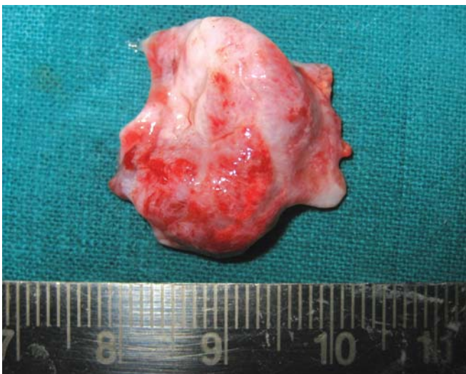
Fig. 6: Enucleated cyst lining

portion(Fig. 4). The defect lining was carefully enucleated. A lining of dimension 2.5 \times 2.3 cm was excised (Fig. 5). The bony defect was curetted properly and irrigated with normal saline. After complete debridement and achievement of hemostasis, retrograde filling was done in the root canal apices with self cure type II Glass Ionomer Cement. Interrupted sutures were placed with nonresorbable suture material (silk) (Fig. 6). The patient was advised antibiotics Amoxicillin 250 mg tid for five days and analgesics Ibuprofen 200 mg tid for 3 days. The patient was recalled after 7 days for suture removal. Further the patient was kept on monthly follow-up. The cyst lining was sent for histopathological examination which revealed a stratified squamous cell lining with no atypical cells present. The subepithelial tissue was infiltrated by subacute inflammatory infiltrate suggestive of a radicular cyst (Fig. 7). The patient has been found to be symptomless with resolving periapical radiolucency for last one year of follow-up (Fig. 8).