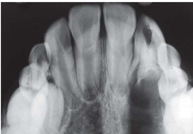
Fig. 3: Occlusal radiograph