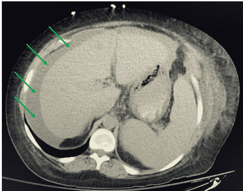
FIGURE 1: Representative CT image of the abdomen showing ascites.

Green arrows indicate the location of ascites.