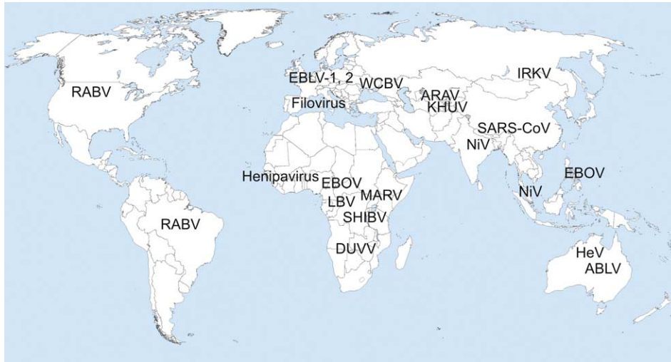
Fig. 1. Bat-associated and presumable bat-associated EIDs. Abbreviations: RABV, =rabies virus; EBLV-1,2 =European bat lyssaviruses type 1 and 2; WCBV =West Caucasian bat virus; ARAV =Aravan virus; KHUV =Khujand virus; IRKV =Irkut virus; LBV =Lagos bat virus; SHIBV =Shimoni bat virus; DUVV =Duvnaha virus; MARV =Marburg virus; EBOV =Ebola virus; Filovirus =unclassified filovirus detected in bats in Europe; HeV =Hendra virus; NiV =Nipah virus; Henipavirus =unclassified henipavirus; SARS-CoV =SARS coronavirus.

indicate that bats do maintain lyssavirus circulation in these territories.