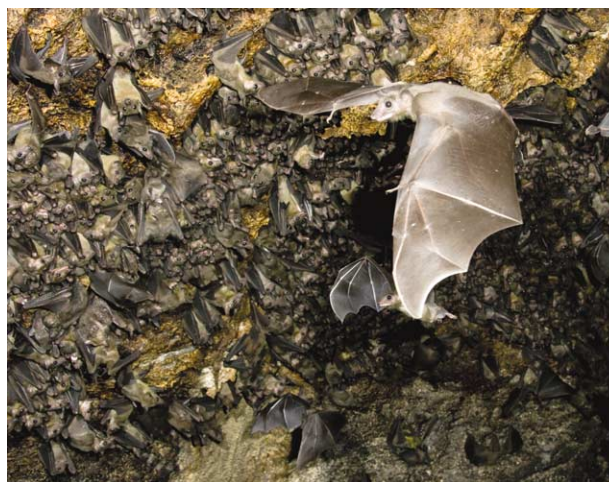
Fig. 2. A dense colony of the Egyptian fruit bats ( Rousettus aegyptiacus ) in cave (Photo by Ivan V. Kuzmin).

However, the detailed ecology of filoviruses is still unknown. Reports on seroprevalence in bats are somewhat controversial. Colonies of R. aegyptiacus in caves often consist of tens of thousands of bats (Fig. 2). The opportunity for conspecific exposure rates in such colonies appears quite high and, therefore, bat populations should have a significant seroprevalence rate to these viruses. For example, seroprevalence to lyssaviruses in some colonial bat species was reported as high as 60–70% (35). In contrast, the seroprevalence of MARV neutralizing antibodies in colonies of R. aegyptiacus where PCR-positive bats were collected was only approximately 12% or as low as 2.4% (52,57). It is still unclear whether bats are the principal reservoir hosts of filoviruses, or if they represent a spillover infection from some other source. In fact, the identity of gene sequences from bat and human isolates does not necessarily mean that humans were infected from bats. Potentially, bats and humans could be independently and simultaneously infected from some other source in mines and caves.