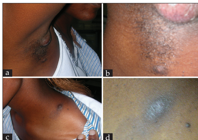
Figure 2: Boils were pale yellow, particularly at the site of tick bite and the entire surface became painful when they were about to drain greenish-yellowish pus (a) and (b). At the base of the neck, there was a tumor surrounded by a faded but noticeable rash around it (c). After healing, this mark (c) remained as a hard painless tumor. After discharging greenish-yellowish pus, the painful boil ulcerated and started healing gradually and became dry with an inoculation eschar including central necrosis, edematous margins and erythematous halo at the former site of the tick bite (d)

One day following a session of tick survey at Mwea National Reserve, mild but persistent itching and scratching ensued around the neck, on the back and in the armpit of the right hand side of a 30-year-old African woman. Little did it occur to her that this could be due to the ticks she had been surveying, collecting and storing a day before. She invited her friends to help with keen physical observation of her specific body sites and clothes so as to find out what the itching and scratching was all about. To her surprise, at the specific body sites of scratching, they recovered ticks, which were later identified to be R. pulchellus except on the back (probably had dropped off and probably at the time of biting, ticks had not been infected with the etiological agent(s)). Two days after the recovery of the ticks, she noticed redness followed by the emergence of severe swelling and ulcer formation at the specific biting sites along with swollen regional lymph nodes. This intensified the pain at the specific biting sites