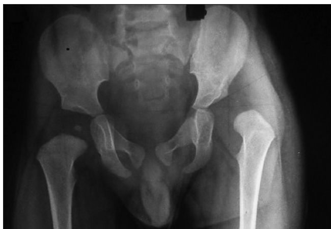
Figure 1: X-ray anteroposterior view of pelvis showing both hips in a 16-month-old infant showing unilateral developmental dysplasia of the hip on the left side with absence of ossific nucleus at the time of open reduction