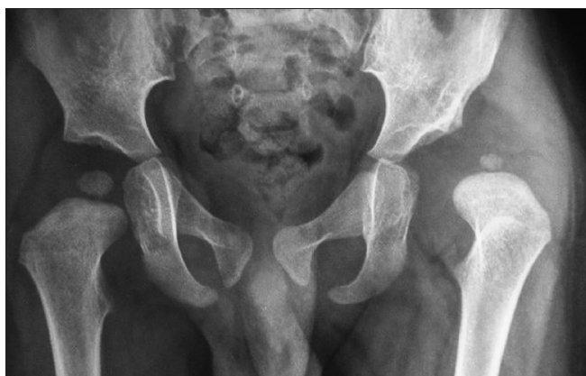
Figure 3: The child underwent open reduction and spica application. X-ray pelvis with both hip joints anteroposterior view showing redislocation of the hip 6 months after spica removal

12 weeks (range 8–14 weeks). Postspica care involved night time abduction brace for all children for 6 months.