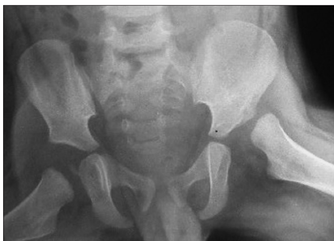
Figure 2: Frog leg lateral view of the same child showing dislocation (L) hip