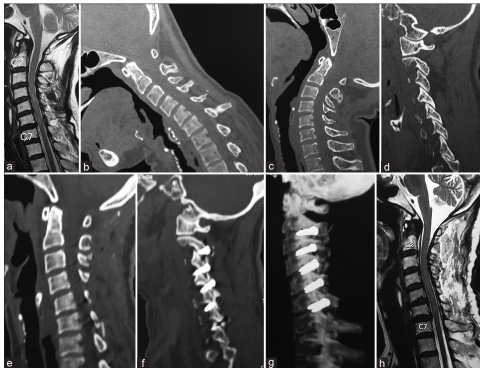
Figure 1: Images of a 57-year-old female patient [Table 1- Case 1]. (a) T2-weighted magnetic resonance imaging showing moderate cervical spinal degenerative changes in the form of bulging disc spaces and ligamentum flavum. Intra-axial cord signals are seen at C4-5 and C6-7 levels. (b) Computed tomography scan with the head in flexed position does not show any evidence of bone injury or instability. (c) Computed tomography scan with the head in the extended position. (d) Computed tomography scan cut passing through the facets showing no significant abnormality or instability. (e) Postoperative computed tomography scan showing the cervical spine alignment. No posterior decompression has been done. (f) Computed tomography scan cut through the facets showing transarticular fixation. (g) Computed tomography scan showing the fixation construct. (h) Delayed magnetic resonance imaging (after 3 months of surgery) showing regression of the osteophyte and resolution of intra-axial spinal cord changes

in all 14 patients. The most frequent levels showing cord signal changes were C3-4 and C4-5. There was no evidence of cord hemorrhage in any of the patients. There was loss of cervical lordosis in 12 out of 14 patients. All patients had incomplete spinal cord injury at the time of presentation. All the presented patients had improved to varying degrees following the initial insult but still had significant neurological