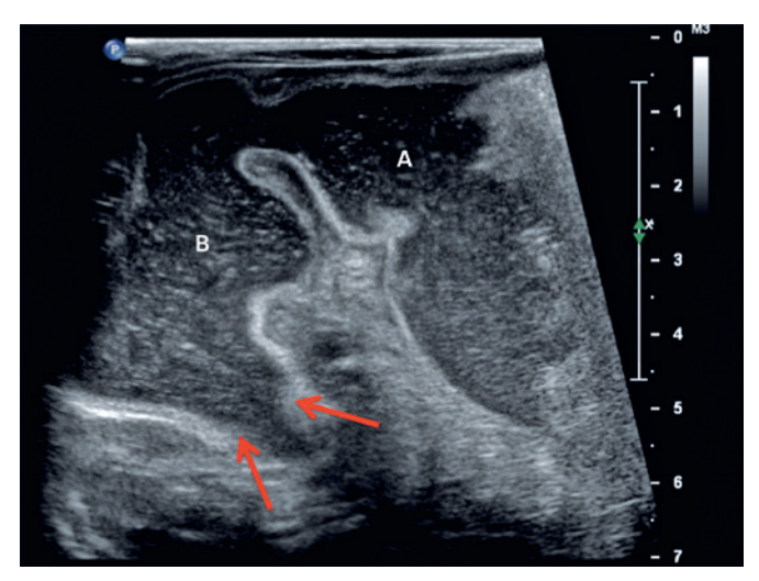
Figure 1. Ultrasonography with a high frequency linear transducer shows distension of the gastric antrum (A) and duodenal bulb (B). The duodenal membrane reduces the lumen of the second duodenal portion (arrows)

At our hospital, an abdominal ultrasound (US) was performed (Figures 1 to 3), which excluded pyloric stenosis or other lesions in the abdomen. A duodenal membrane was detected. There was an obstruction at the second portion of the duodenum with upstream dilatation.