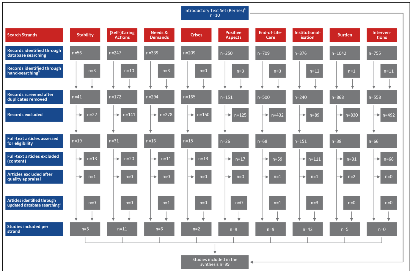
Figure 2 Flow diagram. a The introductory text set ('berries') was established prior to the database search. b Hand-searching included backward citation tracking and snowballing. c Updated databases search followed the same process as the initial search with the removal of duplicates, screening and assessment for eligibility.

details of the methodology were published in the respective study protocol. 27 This meta-study is registered at the International Prospective Register of Systematic Reviews (PROSPERO registration number CRD42016041727). The reporting of this publication follows the recommendations in the ENTREQ statement. 28