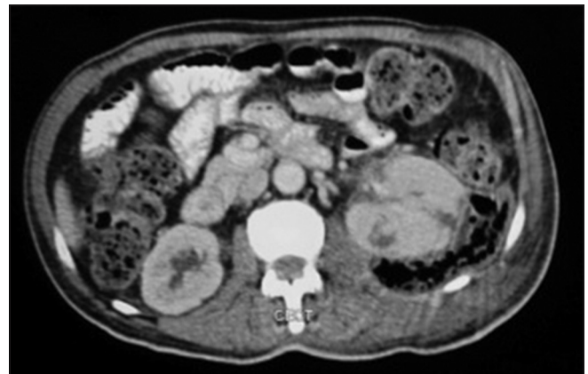
Figure 2: CECT showing emphysematous pyelonephritis of left kidney