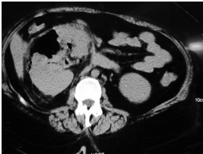
Figure 3: CECT showing emphysematous pyelonephritis of right kidney