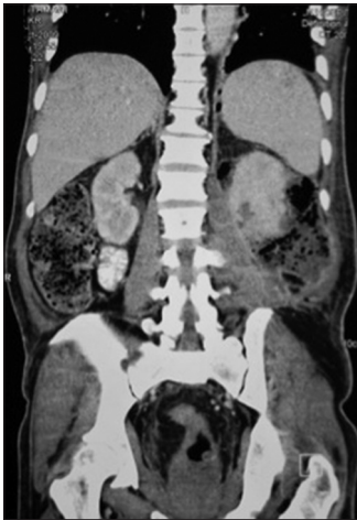
Figure 1: CECT with coronal reconstruction showing emphysematous pyelonephritis of left kidney

abdomen and back, with a history of on and off fever and generalized ill health for the past 2 weeks. She was a known diabetic but was on irregular treatment and poorly controlled according to the records available. Examination showed the patient to be febrile, along with tachycardia of 110/min. The patient was normotensive at admission. The patient was pale but had no other significant finding on general physical examination. Examination showed an ill-defined tender lump occupying the right lumbar and hypochondrium of approximately 10 × 8 cm size. Because of the tenderness and obesity of the patient the characteristics of the lump could not be elicited fully. Hematological investigations showed a hemoglobin of 5 g/dl and total count of 13,000/mm 3 . Biochemical investigations showed a blood sugar of 350 mg/dl with ketonuria, deranged blood urea (100 mg/dl) and serum creatinine (3 mg/dl). X-ray of the abdomen revealed air lucencies along the right psoas muscle, but no free air under diaphragm. Because of suspicion of emphysematous pyelonephritis, a CT scan was ordered and this revealed the right kidney enlarged with multiple air lucencies in the