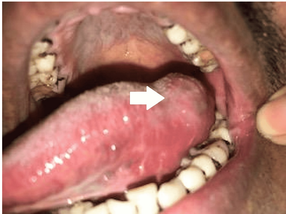
FIGURE 1: Intraoral picture showing left lateral tongue swelling (white arrow)

Other areas of the oropharynx and oral cavity were normal, and no cervical lymph nodes were palpable. A biopsy of the lesion was performed under local anesthesia, and a histopathological examination (Figure 2) revealed the presence of intramuscular oocyst with elongated bradyzoites, which was consistent with sarcocystosis. Routine blood examination, including complete blood count, liver enzymes, renal function test, and creatine kinase, was found to be normal. He was started on oral Albendazole 400 mg once daily for two weeks, and his subsequent follow-up showed resolution of the tongue swelling.