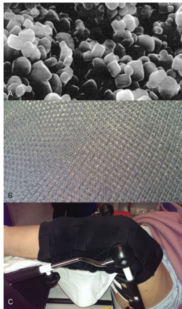
Fig. 1 Knee pad. (A) Ultrastructure at the electronic microscopy. (B) Detail of the knee pad tissue. (C) Gross appearance of the device.

A total of 27 patients at the authors' institution were selected for a single-blind, randomized study on the use of a knee pad after surgery. The study was performed at an interval of 12 months. All the patients were informed about the characteristics of the knee pad and the study, and the Institutional Review Board approved the study based on the Declaration of Helsinki. Inclusion criteria were indication for a primary TKA and possibility to attend