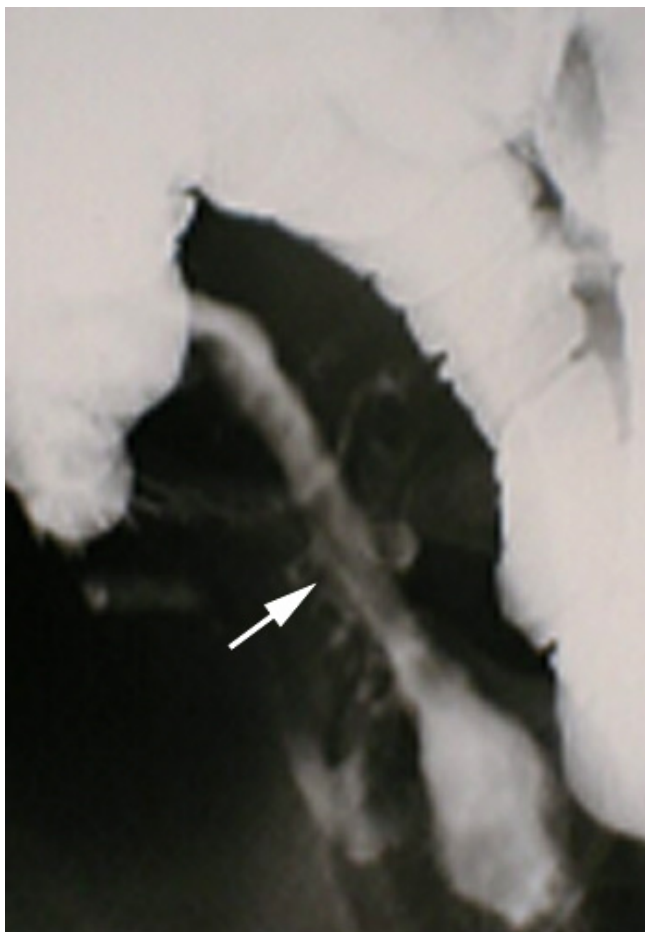
Figure 1 Small bowel double-contrast enteroclysis (detail) showing a stricture (arrow) of the terminal ileum with a thickening of the wall.

After inductive therapy with azathioprine and corticosteroids, the patient was maintained with mesalazine 500 mg \times 4 daily. Prednisone 50 mg/day was added only during acute phases; in the six years following the discharge, 2 episodes of abdominal pain and diarrhea requiring steroid therapy were recorded. Seven years later the patient was admitted to our Institution for abdominal pain, nausea, iron deficiency anemia, hypoalbuminemia, and intestinal obstruction. On physical examination no masses in the abdomen were noted. Small bowel double-contrast enteroclysis (Fig. 1) showed a stricture of the terminal ileum with a thickening of the wall without extravasation of the contrast material. CT scan performed by using intravenous and oral contrast material revealed thickening of the terminal ileum with stranding of the mesenteric fat. There was no clinical evidence of carcinoid tumor so biochemical tests for carcinoid syndrome were not carried out.