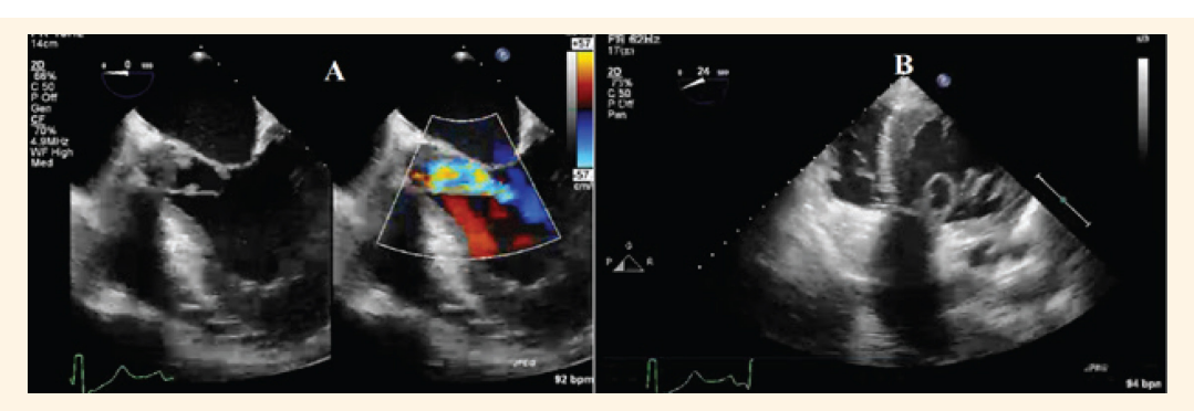
Figure 1: A: A mid-oesophageal 5-chamber 2-dimensional transesophageal echocardiography view with colour Doppler blood flow map showing the prolapsing aortic cusp into the left ventricular outflow tract producing severe aortic regurgitation. B: A deep transgastric view of the left ventricular outflow tract showing the prolapsing flap of dissection reaching and deforming the anterior mitral leaflet in diastole leading to diminished leaflet excursion.

*Madan M. Maddali,¹ Avinash Chauhan,¹ Pranav S. Kandachar,² Mohammed Al-Mukhaini³