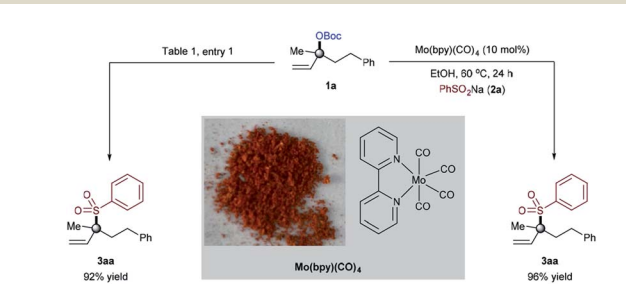
Fig. 3 Mechanistic experiments.

To gain mechanistic insight and the initial understanding on how the reaction works, we decided to study the reactivity of [\text{Mo}^0\text{L}_n] species (Fig. 3). The [\text{Mo}(\text{bpy})(\text{CO})_4] complex<sup>23</sup> was prepared on a large scale by reacting \text{Mo}(\text{CO})_6 and 2,2′-bipyridine (L1) in THF at 60 °C.¹6 As shown in Fig. 3, the structure was confirmed and further analyzed.²4 Interestingly, the