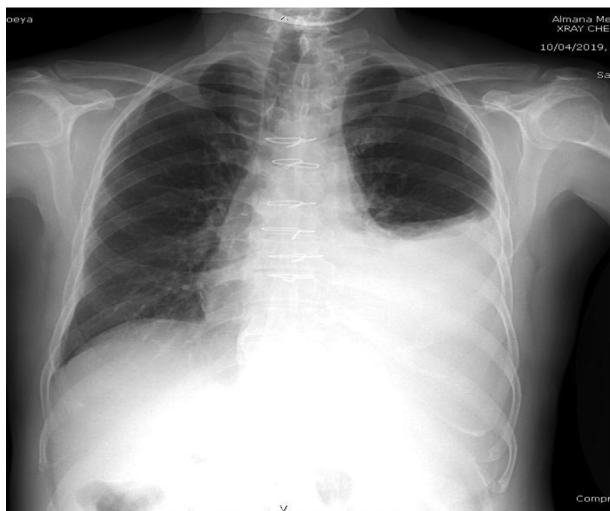
Fig. 1. Chest X-Ray showing left sided pleural effusion.

Conservative management involves nil per os (NPO), total parenteral nutrition, chest tube drainage of the chyle, and later when the drainage has decreased significantly, starting a low-fat diet or