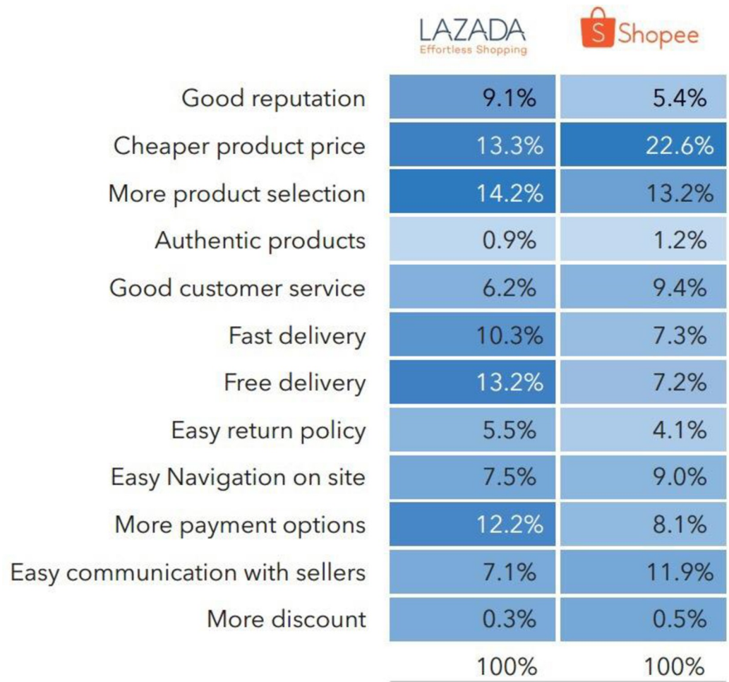
Fig 3. What shoppers like about their favourite e-marketplace, Cite from (aCommerce 2018).

https://doi.org/10.1371/journal.pone.0256837.g003