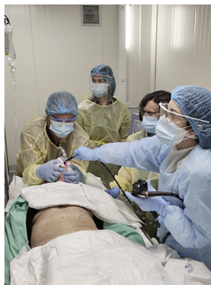
Fig. 1. Esophagogastroduodenoscopy with a standard upper endoscope for PEG placement in a patient with ALS and severe ventilatory impairment under nasal non-invasive ventilatory support.

A 12-h fasting prior to the examination was recommended to the patient and anticoagulation therapy stopped for 1 week (warfarin was substituted by enoxaparin that was stopped 24 h before the procedure).