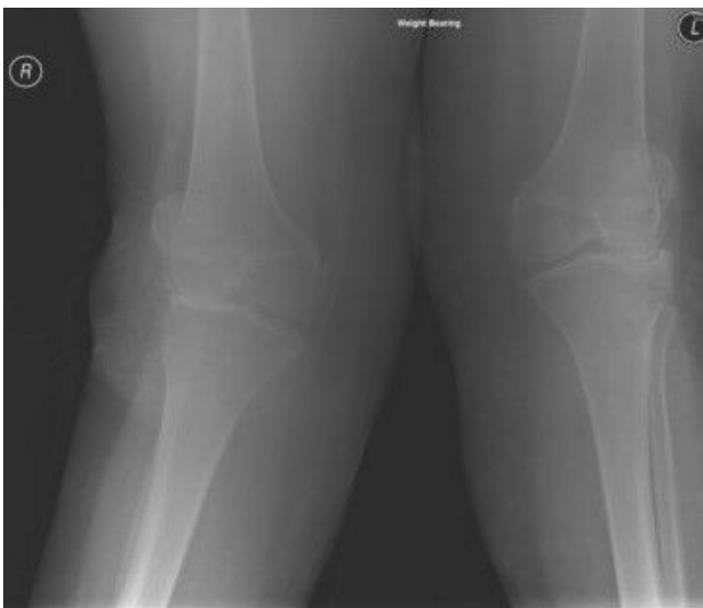
Figure 1 Preoperative weight bearing x-ray of both the knees. Showing severe tricompartmental arthritis and valgus deformity of the right knee.

Tissue samples of the bone and synovium were sent for histology. Both the femoral and tibial tissue showed fibrillation and erosion of the articular cartilage with exposure of the subchondral bone. Attempted fibrocartilaginous repair was overwhelmed by the destructive process. Osteophytes surrounded the edge of the articular surfaces. The subchondral bone showed focal remodelling. The bone had a normal lamellar structure. The marrow tissue was mainly fatty with occasional small foci of normal haemopoietic tissue. The appearances were those of primary and secondary osteoarthritis, with no evidence of a disorder of the bone structure. The synovium showed mild reactive changes with papillary architecture, normal intimal layer and mild, patchy lymphocytic infiltrate, the changes consistent with degenerative joint disease.