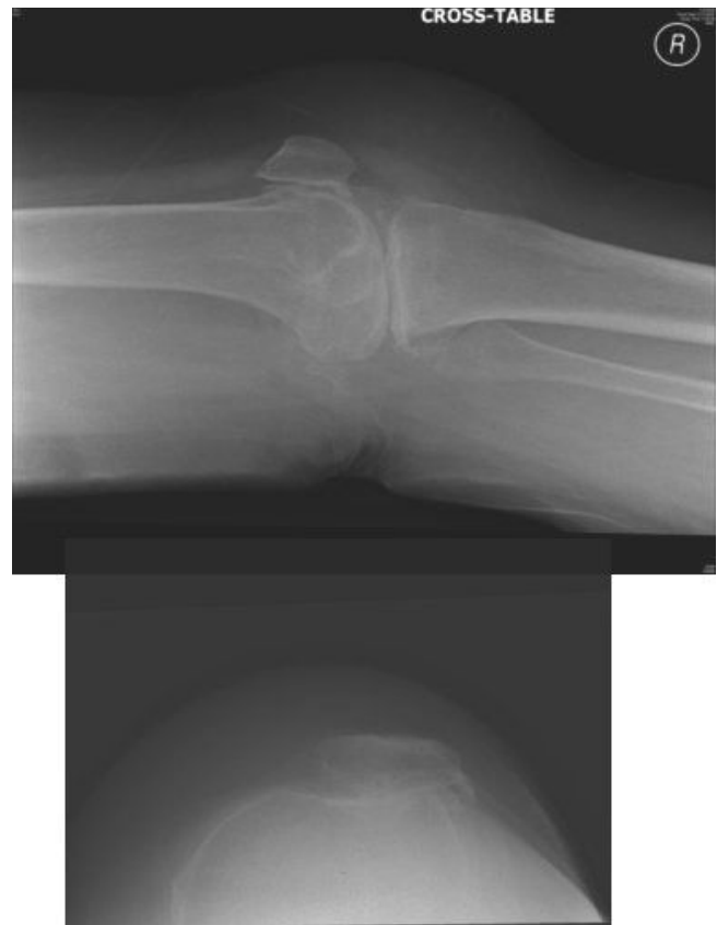
Figure 2 Preoperative lateral x-ray of the right knee and skyline of the patella. Showing severe arthritis and maltracking of the right patella.