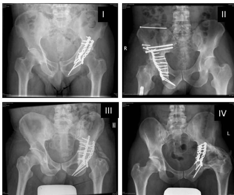
Figure 1 Different grades of heterotopic ossification according to the Brooker classification. I: X-ray of a Brooker class I heterotopic ossification (left hip): ‘islands of bone within soft tissues around the hip’. II: X-ray of a Brooker class II heterotopic ossification (right hip): ‘bone spurs in pelvis or proximal end of femur leaving at least 1 cm between the opposing bone surfaces’. III: X-ray of a Brooker class III heterotopic ossification (left hip): ‘bone spurs that extend from the pelvis or the proximal end of femur, which reduce the space between the opposing bone surfaces to less than 1 cm’. IV: X-ray of a Brooker class IV heterotopic ossification (left hip): ‘radiographic ankylosis of the hip’.

subscales need to be summed up, using the following formula for all dimensions.