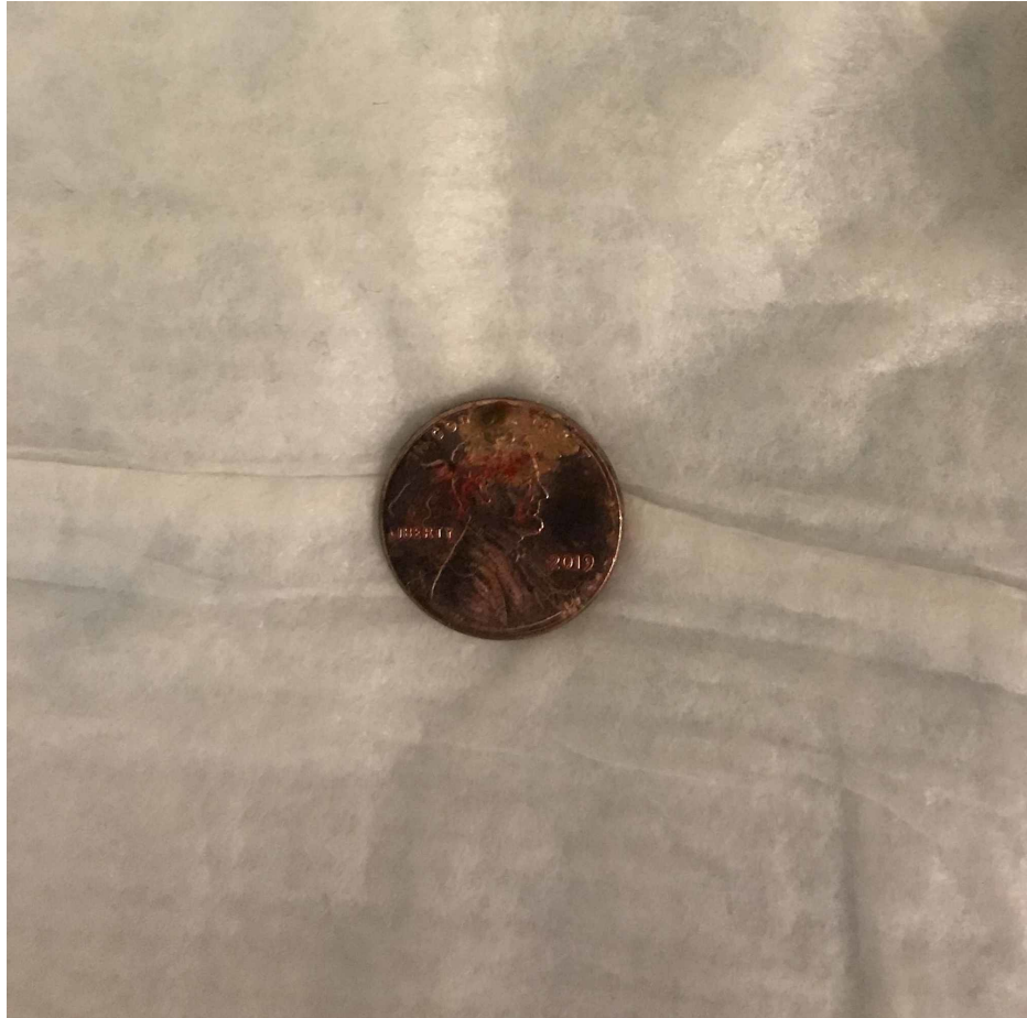
FIGURE 2: Ingested Penny Removed From Stoma via Foley Catheter Retrieval Technique

To remove the object, the pediatric surgeon utilized a Foley catheter foreign body retrieval method. A Foley catheter was inserted and guided blindly (without fluoroscopic or ultrasound assistance) past the foreign body, inflated, and retracted to bring the foreign body to the stoma opening. Forceps were then used to remove the foreign body through the stoma. The foreign body was found to be a penny (Figure 2). The patient was further observed in the ED and appeared well during his observation. He was discharged with follow-up to occur at the surgery clinic.