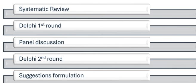
Figure 1 Flowchart of the development of the scenarios, statements and suggestions.

The Delphi method, 13 a consensus-building approach, 14 involved collecting opinions through a procedure ensuring: (a) anonymity—the experts did not know the responses of the other specialists; (b) feedback—the experts could suggest additional