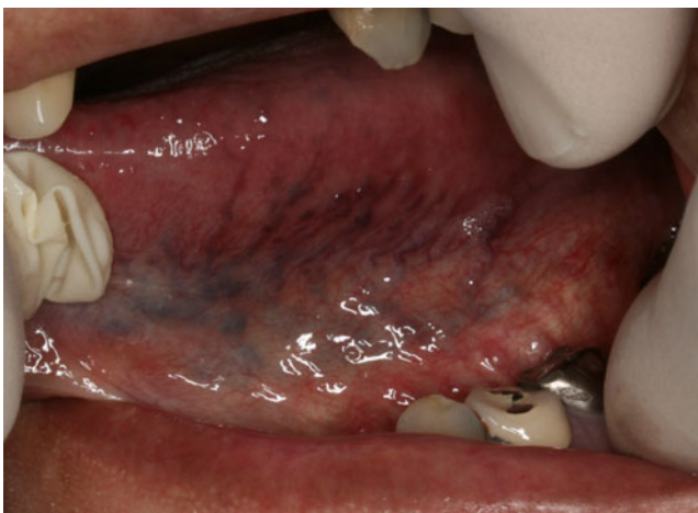
Fig. 2 Oral mucosal telangiectasia on lateral border of tongue

Inter-examiner agreement on caries and periodontal assessment were computed using Cohen's Kappa statistics. The data were analyzed using SPSS 17.0 (SPSS Inc., Chicago, USA). Chi-square test and Fisher exact test were used to study the oral hygiene habits (tooth-brushing and use of other oral hygiene aids), periodontal status, dental visit