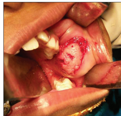
Figure 4: Surgical exposure of swelling