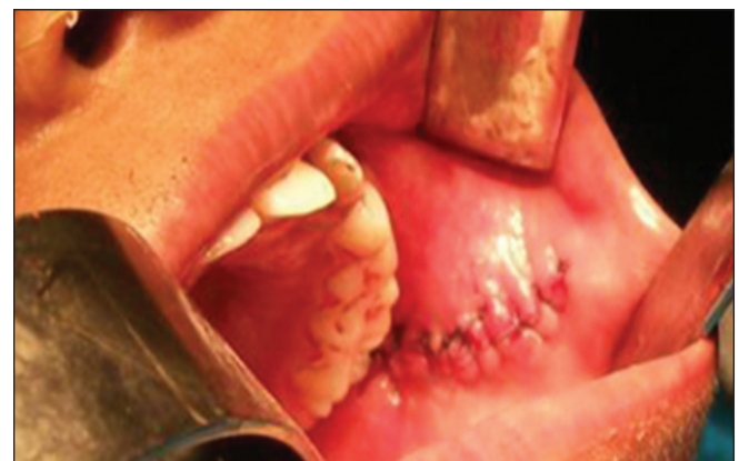
Figure 6: Haemostasis was achieved and the surgical site was sutured with resorbable sutures

oral intubation, infiltration was given over and around the swelling with local anesthetic containing 2% adrenaline. A horizontal incision was made anteroposteriorly using electrocautery along the buccal mucosa and over the most prominent part of the swelling. The swelling was relieved all