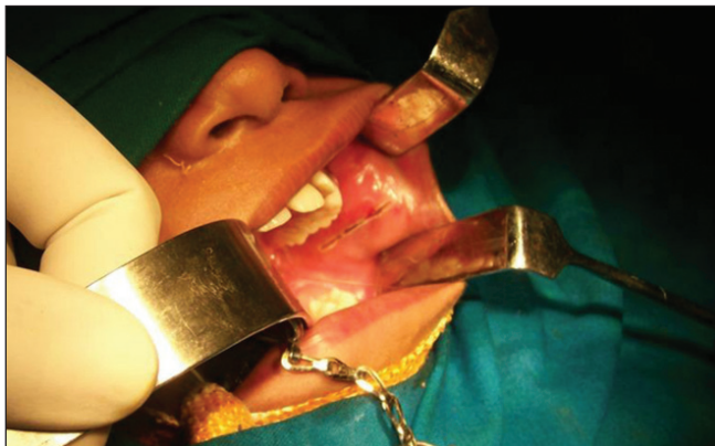
Figure 3: Intra oral horizontal incision made antero-posteriorly using electrocautery along the buccal mucosa and over the most prominent part of the swelling