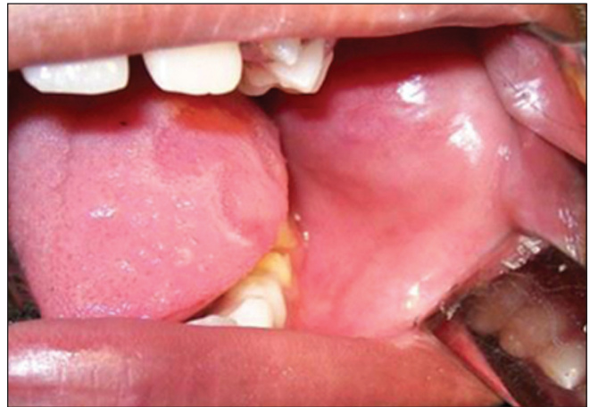
Figure 2: Intra oral swelling i.r.t buccal mucosa