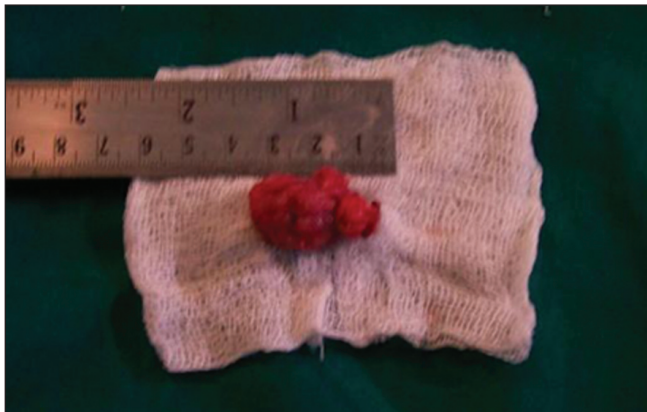
Figure 5: The excised mass was a pinkish white, nodular and nonencapsulated