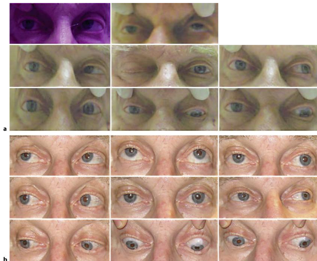
Fig. 1. a Extraocular movements prior to treatment, demonstrating an orbital apex syndrome. b Eye movements after 2 weeks of voriconazole therapy.