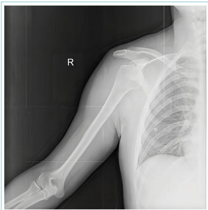
Figure 1. Male patient, 39 years old; AP X-rays of the right shoulder show bilateral anterior shoulder dislocation.