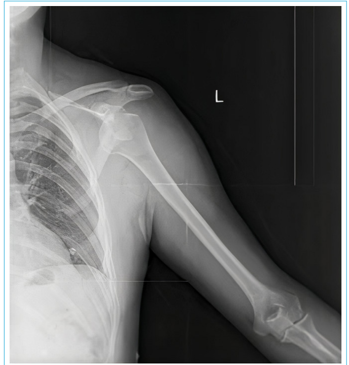
Figure 2. Male patient, 39 years old; AP X-rays of the left shoulder show bilateral anterior shoulder dislocation.

and right shoulders were 25 and 22, respectively. In the 3 rd month, these values were obtained as 40 and 41, respectively, and in the 10 th month, 45 and 43 were the OSS values respectively.